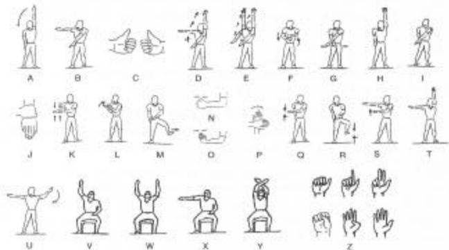
Fig. A The referee lowers his arm from a vertical position to signal (i) the start of the period (ii) to restart after a goal (iii) the taking of a penalty throw.

Fig. B To point with one arm in the direction of the attack and to use the other arm to indicate the place where the ball is to be put into play at a free throw, goal throw or corner throw.